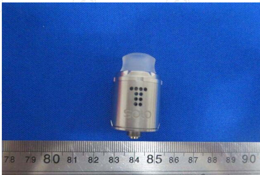
DIGIFLAVOR Drop Solo