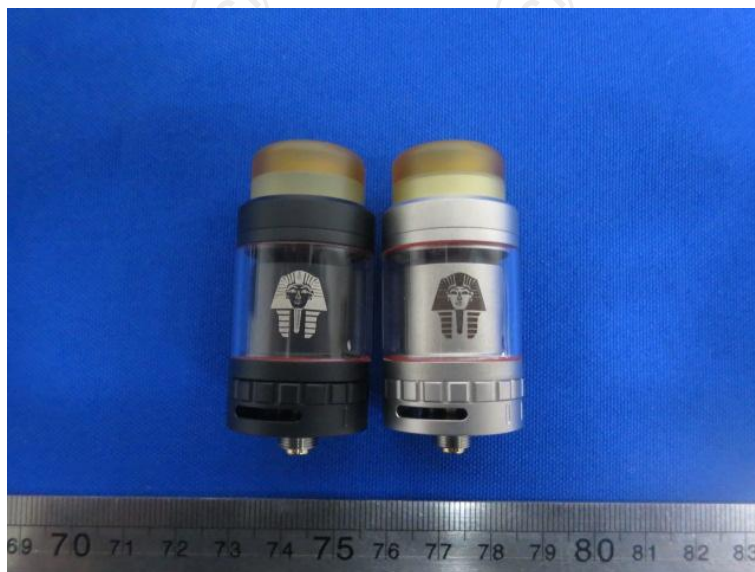
DIGIFLAVOR Pharaoh Mini RTA